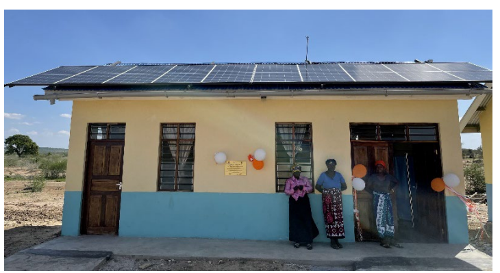
Maternity ward with solar panels installed