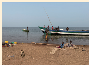
Long-distance to the health center