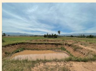
Water with high turbidity in the pond