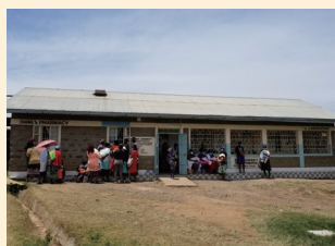
Obstetrics not separated from outpatients