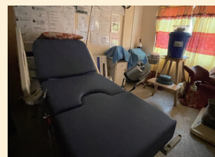
Inadequate equipment for the delivery room