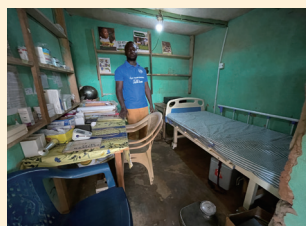
Clinic rented a corner of a private house