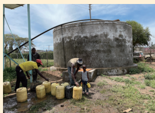
Water with a high salt content