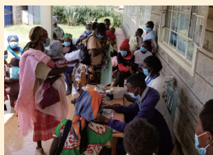
Crowded health center