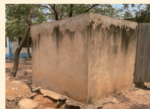
Sanitation facilities installed outside the health center