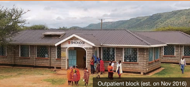
Outpatient block (est. on Nov 2016)