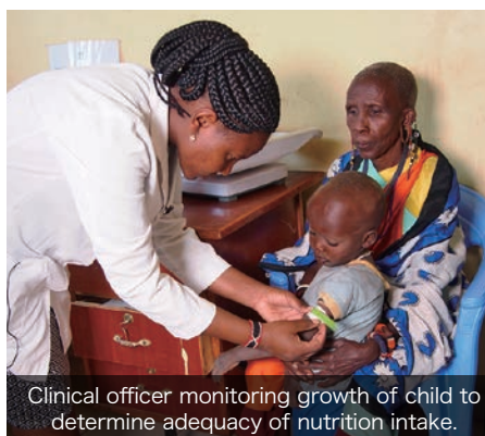
Clinical officer monitoring growth of child to determine adequacy of nutrition intake.