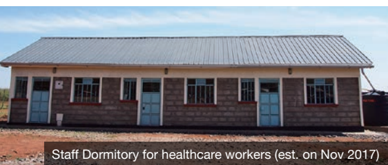
Staff Dormitory for healthcare workers (est. on Nov 2017)