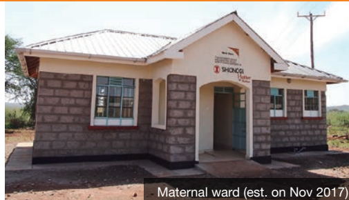
Maternal ward (est. on Nov 2017)