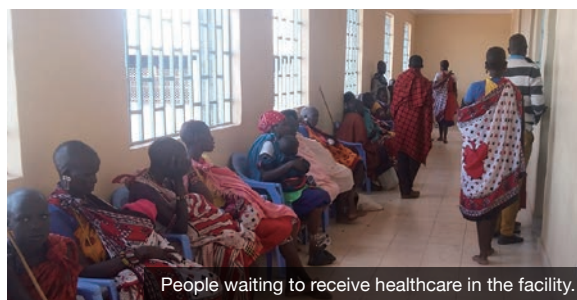
People waiting to receive healthcare in the facility.