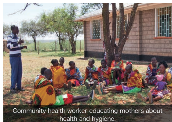
Community health worker educating mothers about health and hygiene.