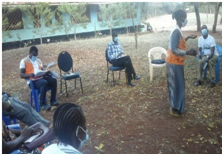
Monthly meeting of village health workers held (at Jaribuni Dispensary, September 2020)