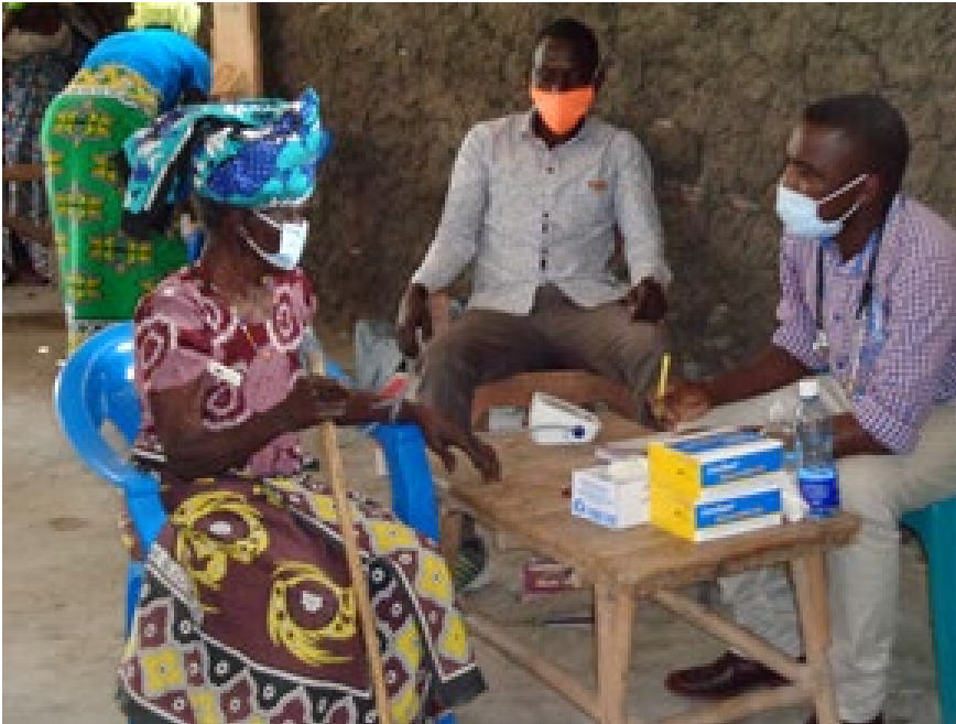
Assistance for household registration given (at Lima La Perla Dispensary, August 2020)

To officials of the Ministry of Health in the county and the sub-county, we introduced this project and regularly reported project activities. We set up a project management committee with the Ministry of Health to regularly report and evaluate the progress of the project.