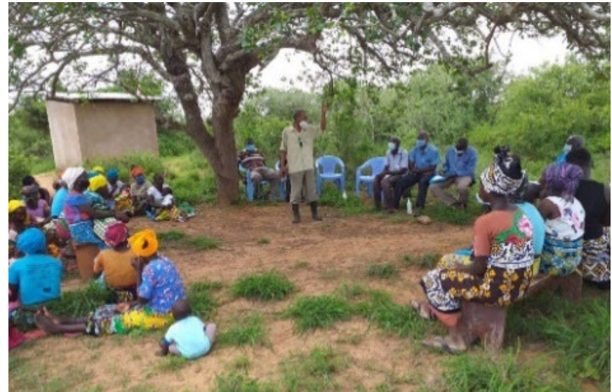
A scene from an agricultural support session for a Mother to Mother group

The sharing of correct information among mothers with common concerns and thoughts as a peer education activity helped encourage them to use health and nutrition services provided at health facilities.