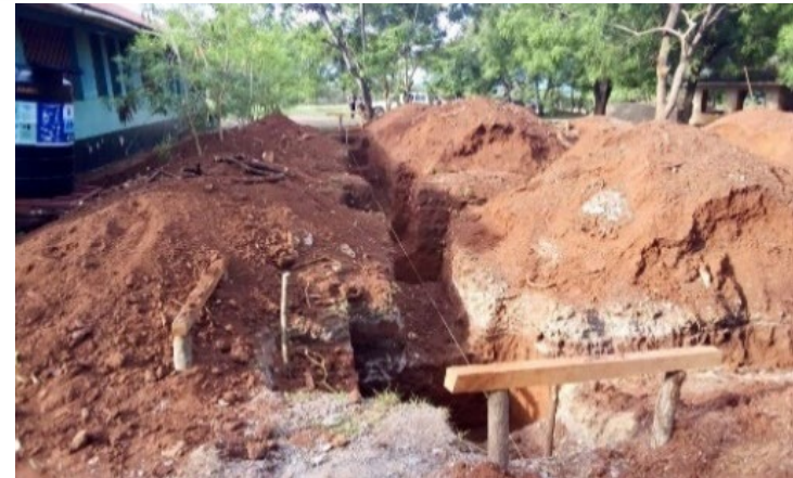
Obstetric ward built (in Jaribuni Dispensary, November 2020)