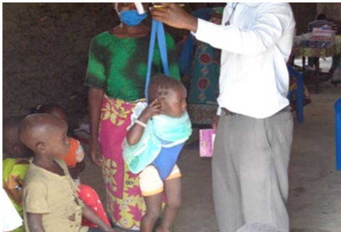
A scene from mobile clinic services (at Midoina Dispensary, September 2020)