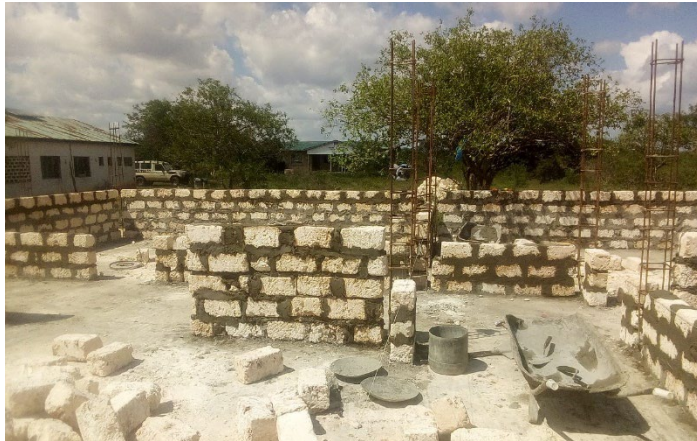
Obstetric ward built (in Midoina Dispensary, November 2020)