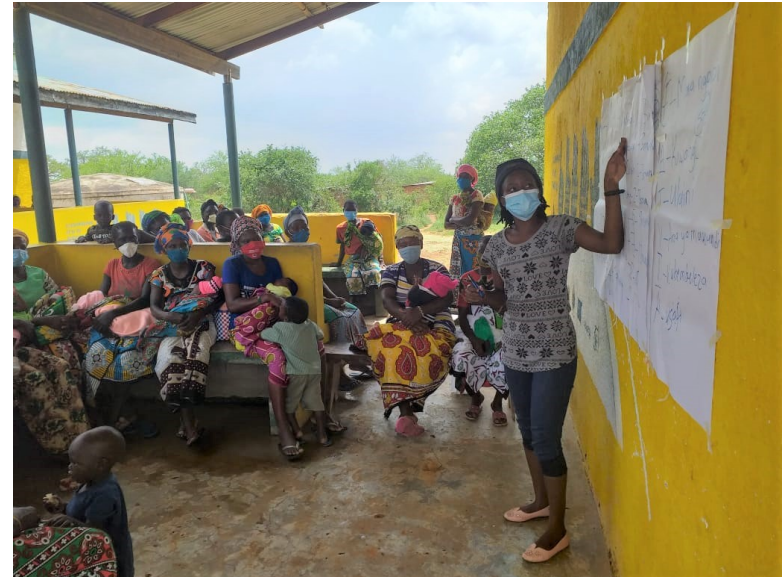
A scene from a training session to deepen knowledge about nutrition for a Mother to Mother group

Items and equipment for protection against COVID-19 distributed and installed: