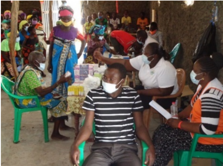
Nutritional improvement activity for residents by medical professionals (at Midoina Dispensary, September 2020)