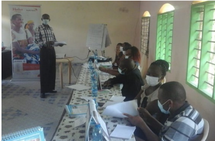
Lecture and technical training given to medical professionals (physician extenders and nurses) working for dispensaries in the project location (September 2020)