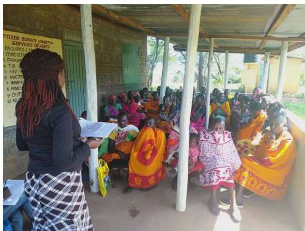
Clinical Officer at Elangata Enterit health facility providing lecture to local mothers on maternal and child health