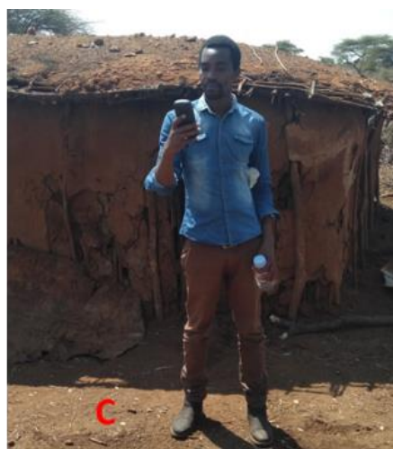
Collecting samples from households