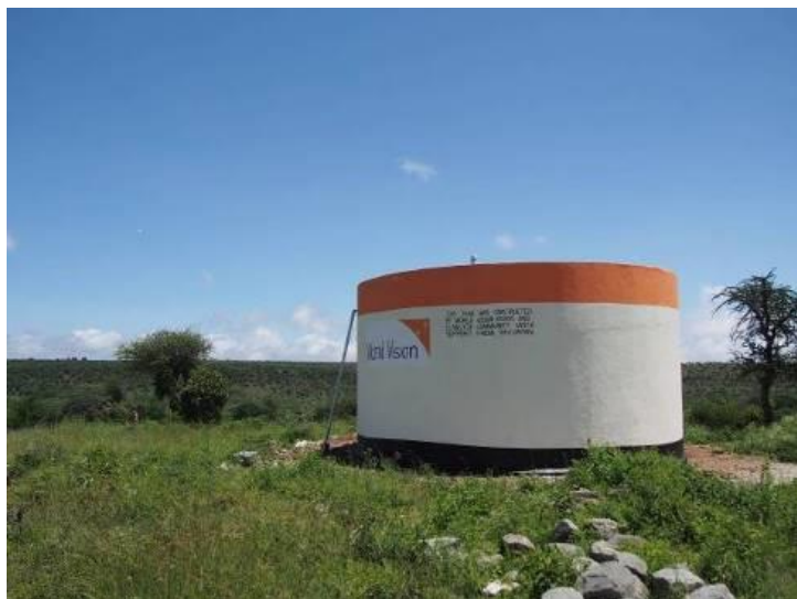
Construction completed on water tank