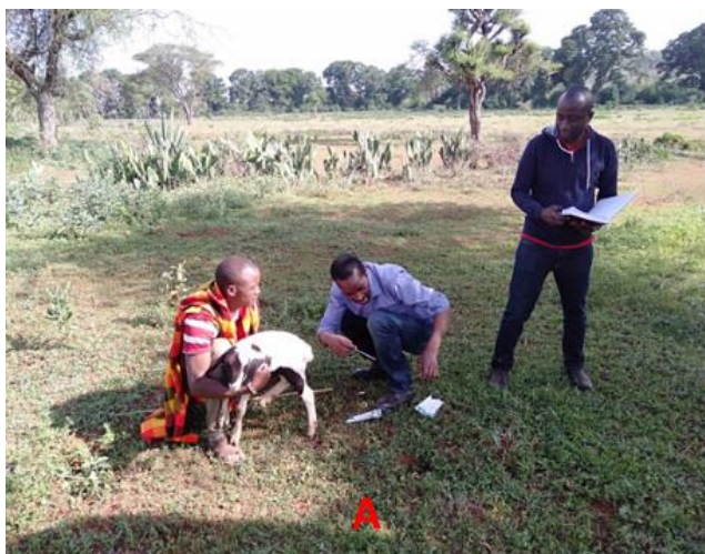
Collecting stool samples from livestock