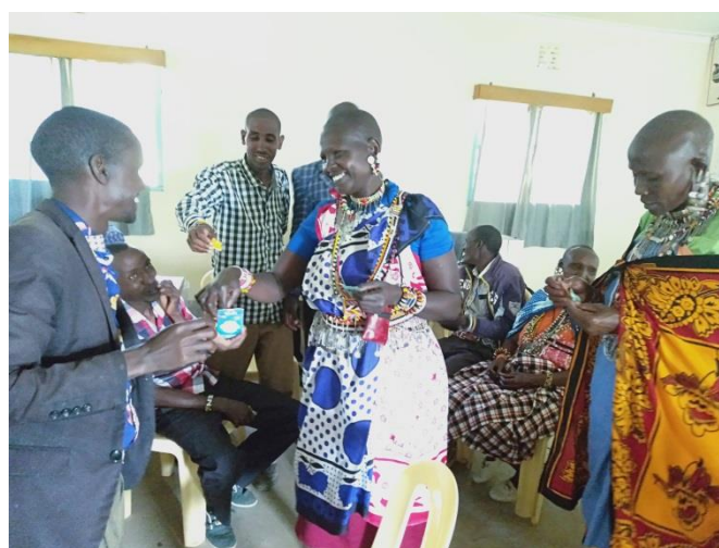
Due collection at a VSLA meeting