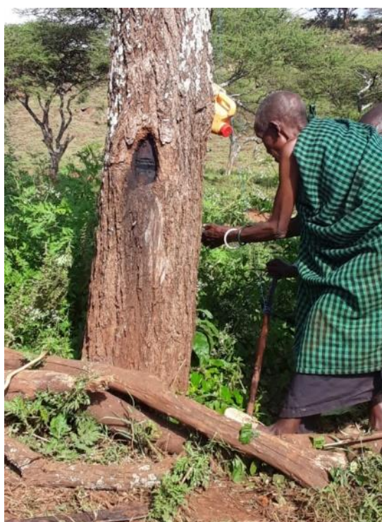
Washing hands using a Tippy Tap device